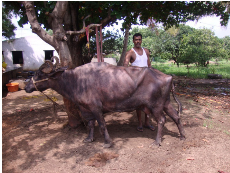
Figure 1. Murrah buffalo with necrosis, gangrene at lower third of the tail and infected wound at tip of the tail.