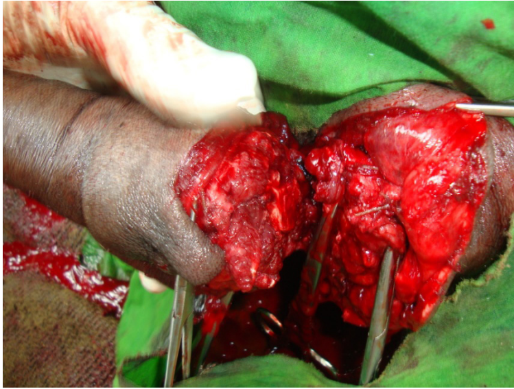
Figure 3. Intervertebral space disarticulation by transaction.