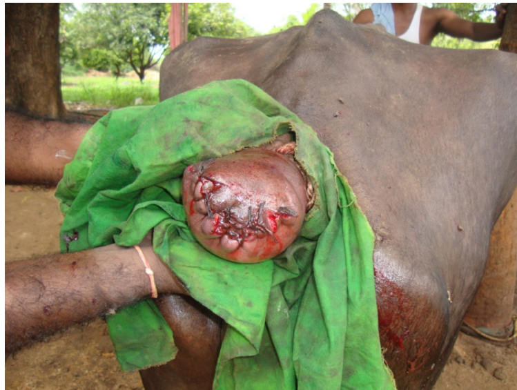
Figure 4. Skin is sutured by simple interrupted suture with silk no.2.