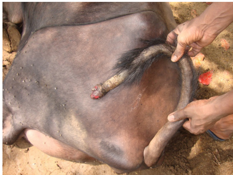
Figure 2. Arrow showing necrosis, gangrene at lower third of the tail and infected wound at tip of the tail.