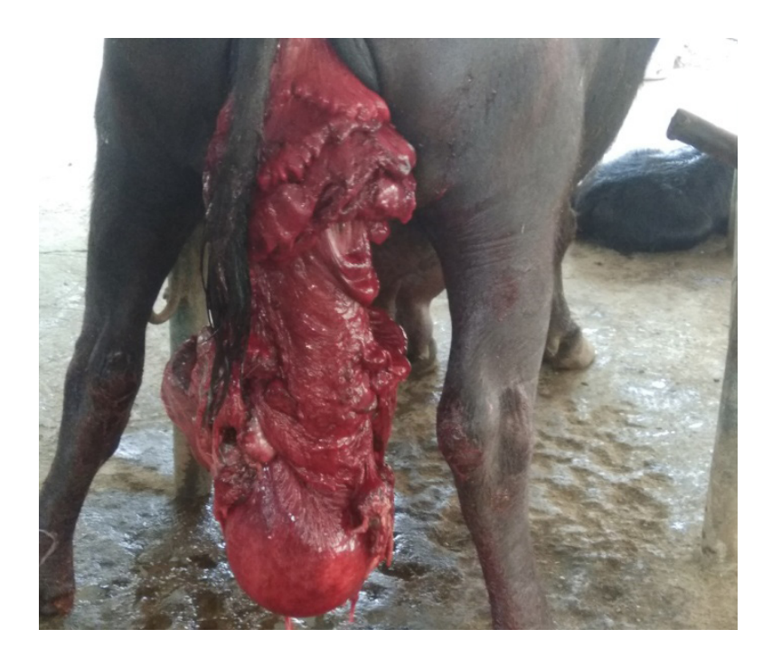
Figure 1. Complete eversion of uterus in graded Murrah buffalo.