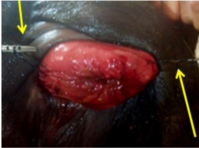
Figure 3. Photograph showing rectal stricture with stay sutures at 3 and 9 '0 clock position (yellow arrow).