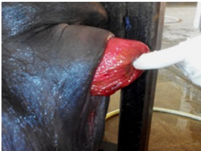
Figure 2. Photograph showing site of rectal stricture.