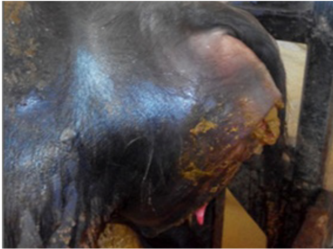
Figure 1. Photograph showing frequent and excessive straining with bulging of almost 15 cm of anal area while defecation of feces.