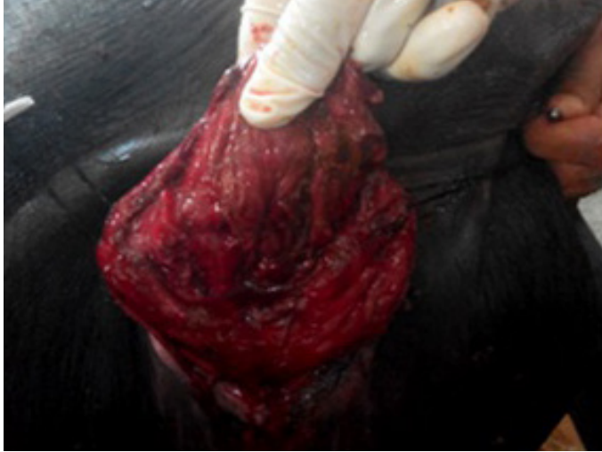
Figure 5. Photograph showing widening of rectal opening after surgery.