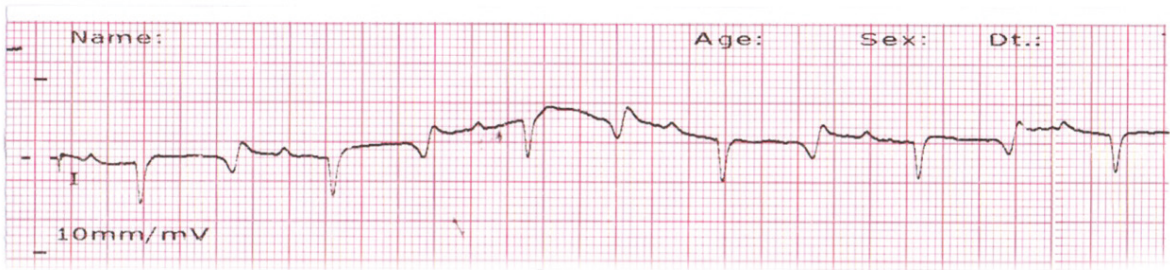
Figure 1. The electrocardiogram of buffalo with hypocalcemia.