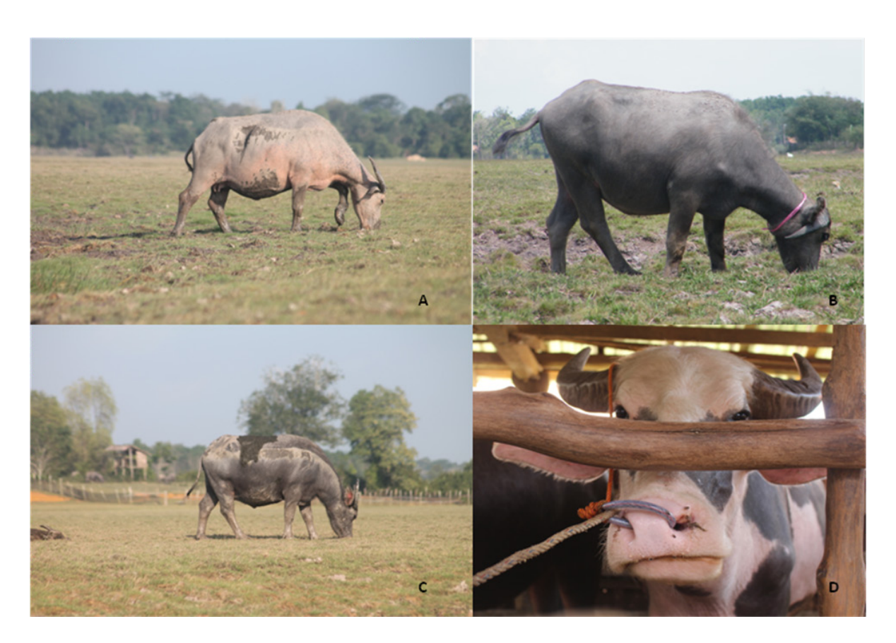
Figure 1. Four variants of the Pampangan swamp buffalo. (a: red buffalo, b: Lampung buffalo, c: black buffalo, d: striped buffalo).