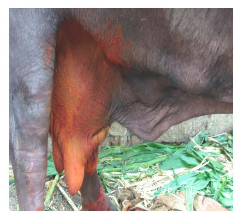
Figure 6. Application of paste - dry.