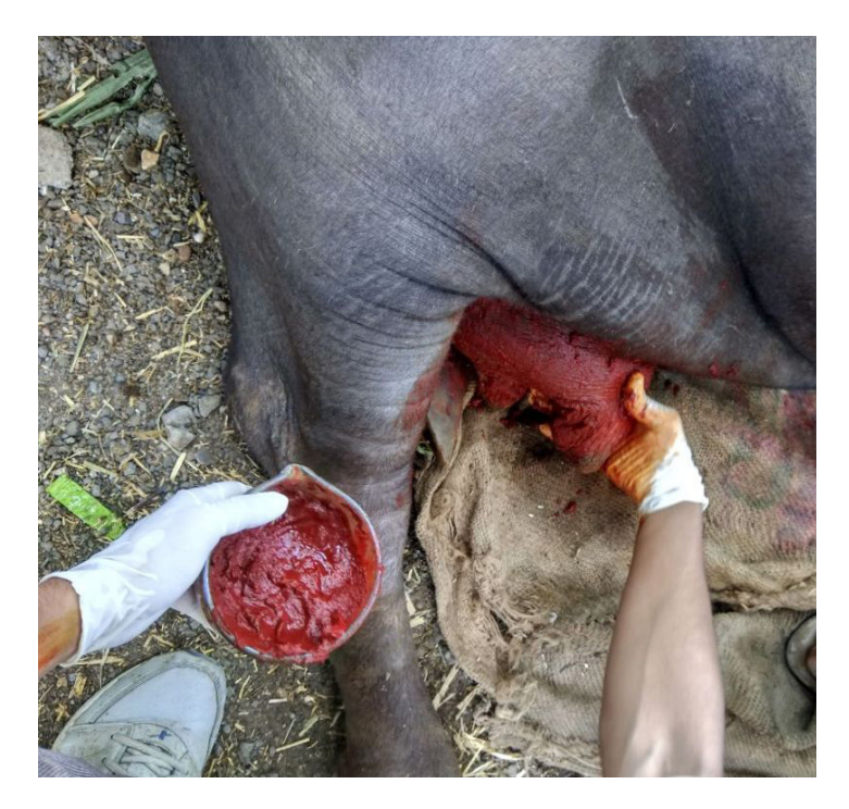
Figure 5. Application of paste - wet.