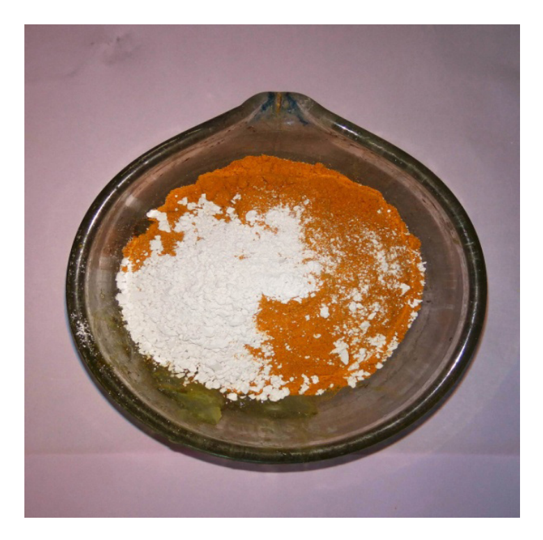
Figure 3. Herbal paste mixture.