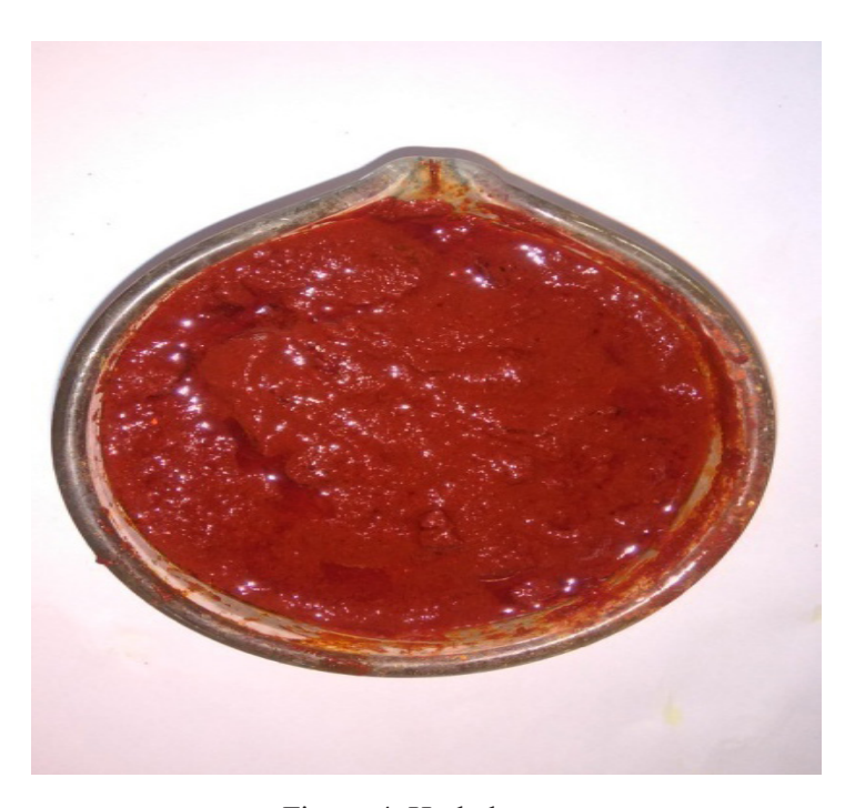
Figure 4. Herbal paste.