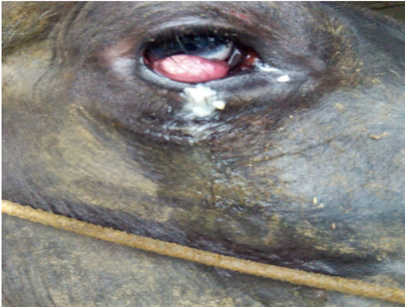
Figure 1. Protruded, ulcerated mass at the sclera corneal junction.