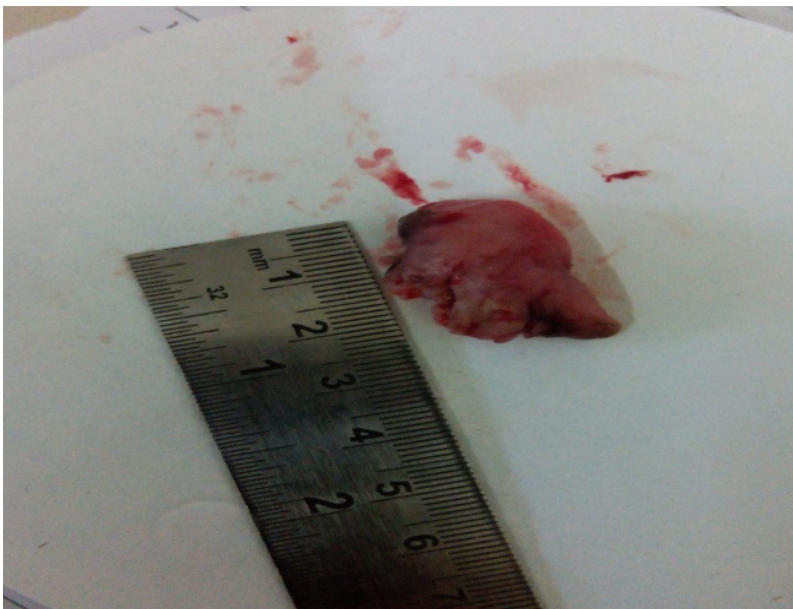
Figure 2. After removal the mass from the eye.