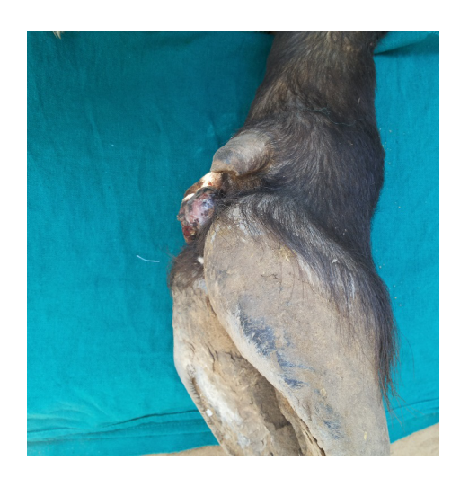
Figure 1. Small nodular mass at the below the dew claw and extending between the digits at posterior aspect of right fore limb of a buffalo.

The animal showed remarkable improvement after 4<sup>rd</sup> post-operative day and animal completely recovered within 8 days.