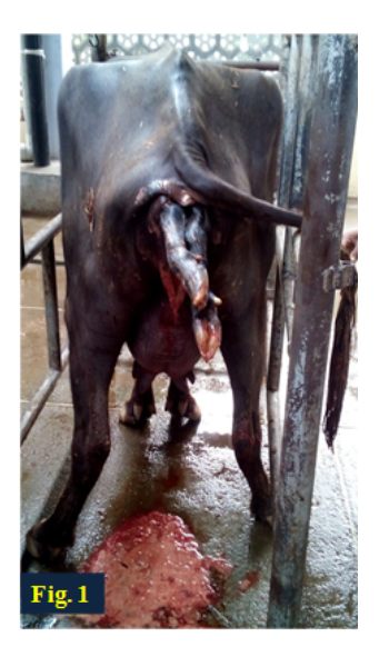
Figure 1. As case reported.

Per vaginal examination revealed that the