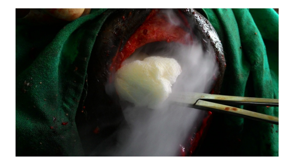
Figure 4. Photograph showing application of liquid nitrogen by swab method.