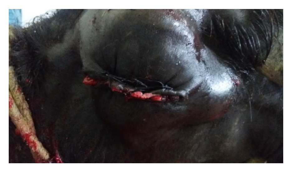
Figure 5. Photograph showing skin closure with gap near medial canthus.