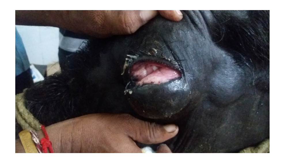
Figure 2. Photograph showing tumour on left lower eye lid - Case 2.