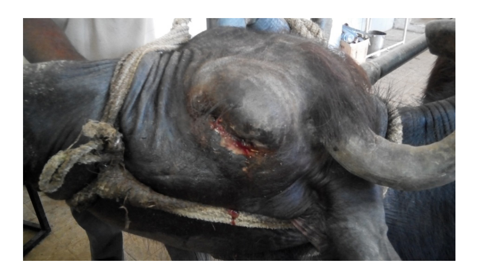
Figure 1. Photograph showing tumour on left upper eye lid - Case 1.