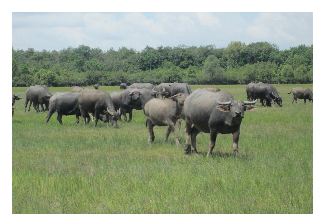
Figure 4. Buffalo condition in Rambutan district when looking for food.