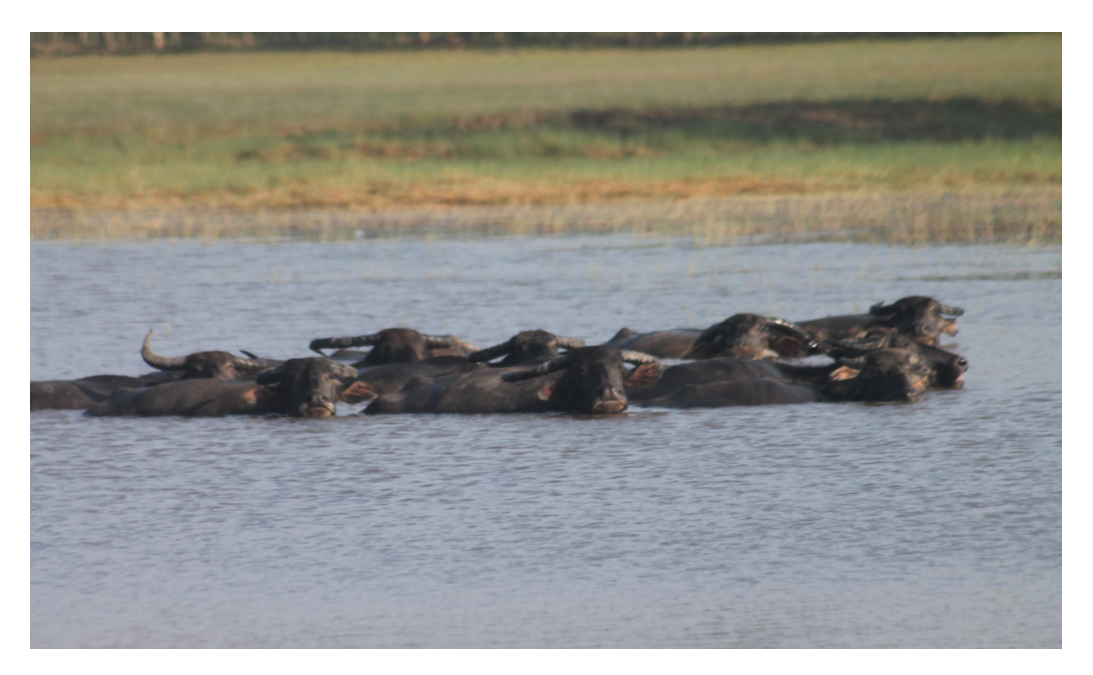
Figure 3. Swamp buffalo much time to soak.