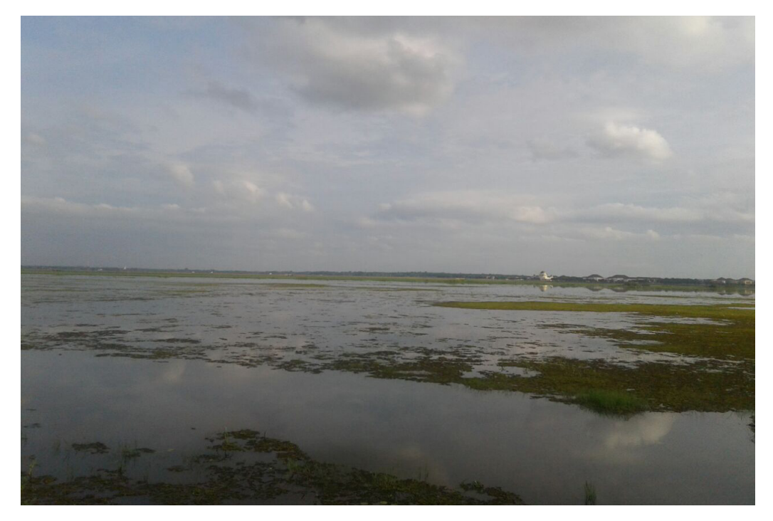
Figure 5. Condition of buffalo habitat in Indralaya district.