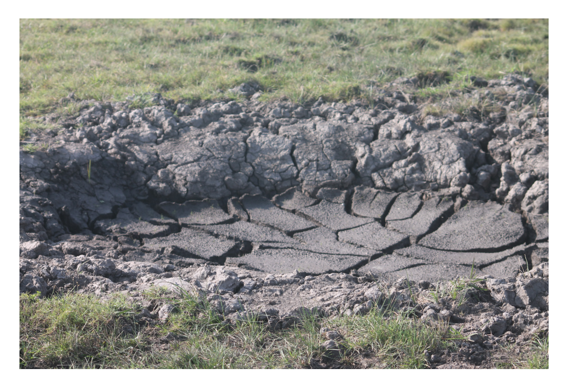
Figure 2. Puddles conditions during dry season.

Figure 1. Research map: research conducted at two locations: Banyuasin district (Rambutan) and Ogan Ilir (Indralaya).