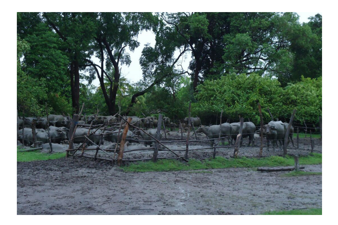
Figure 6. Cage buffalo in Indralaya district no roof cage.