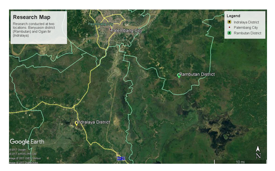
Figure 1. Research map: research conducted at two locations: Banyuasin district (Rambutan) and Ogan Ilir (Indralaya).