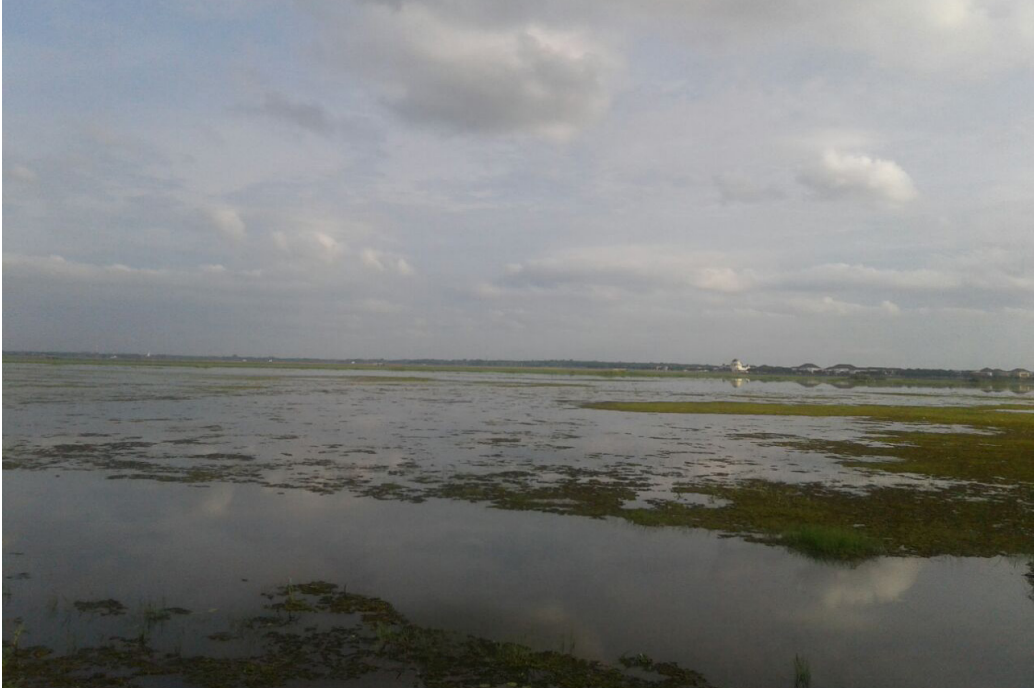
Figure 5. Condition of buffalo habitat in Indralaya district.