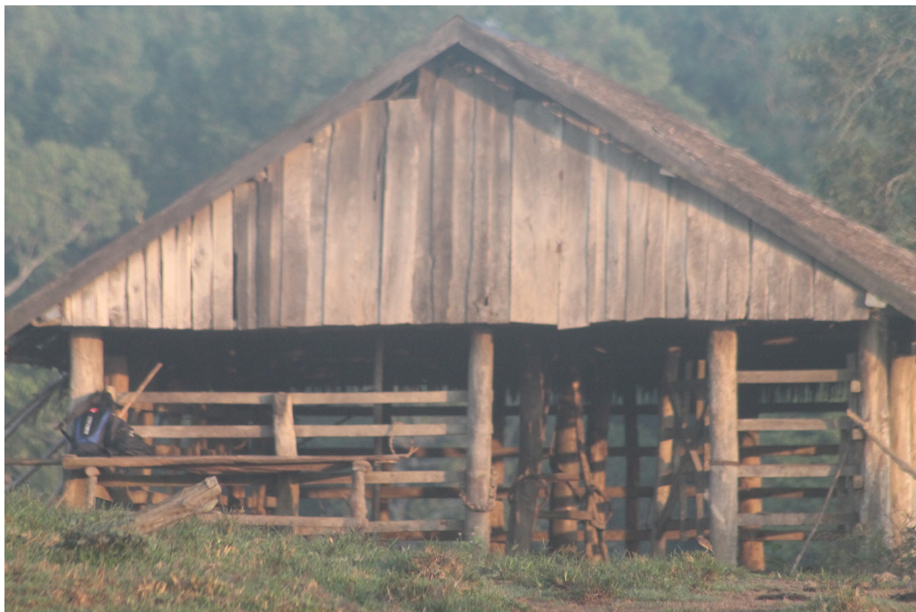
Figure 7. Buffalo cage in Rambutan has cage roof.