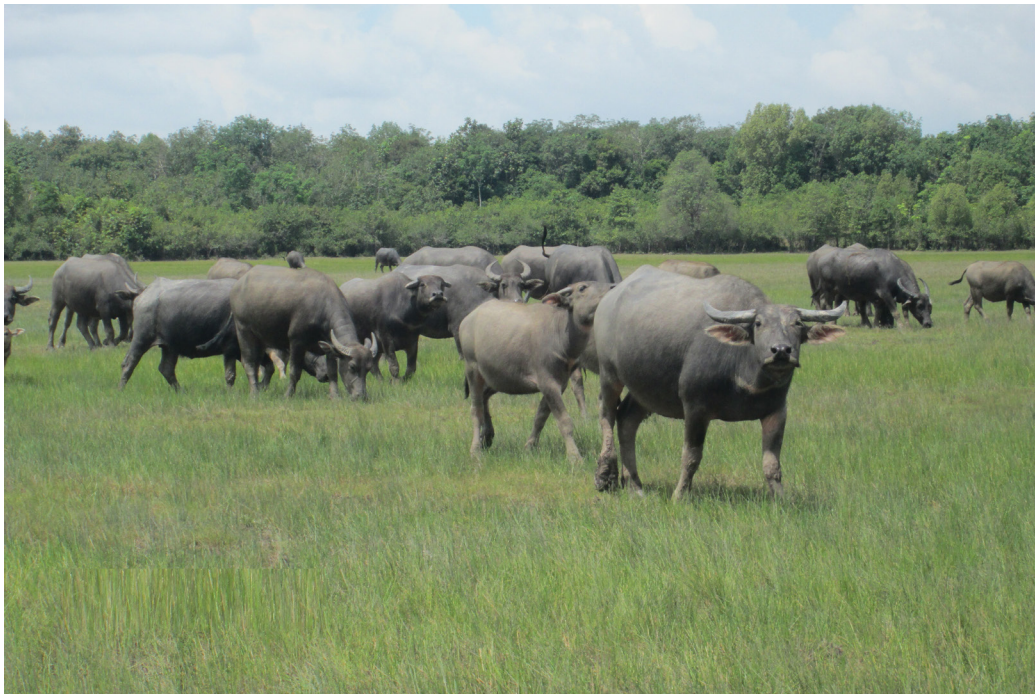
Figure 4. Buffalo condition in Rambutan district when looking for food.