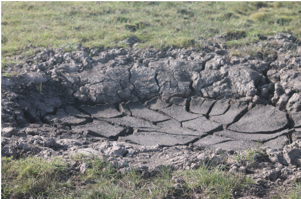
Figure 2. Puddles conditions during dry season.