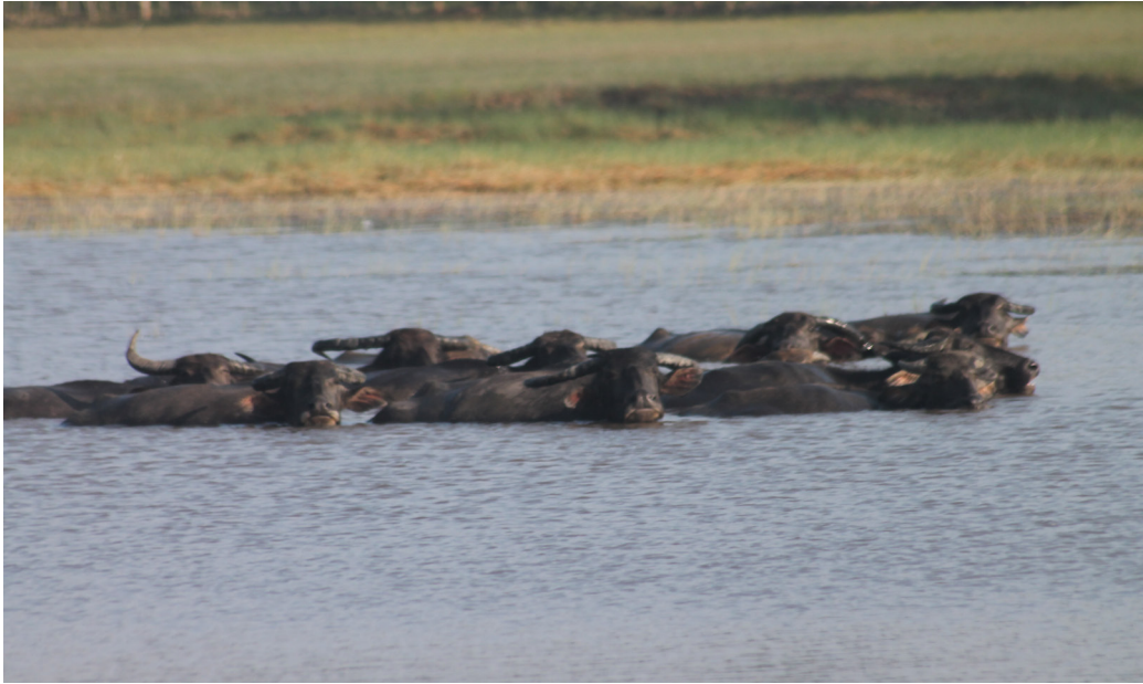
Figure 3. Swamp buffalo much time to soak.