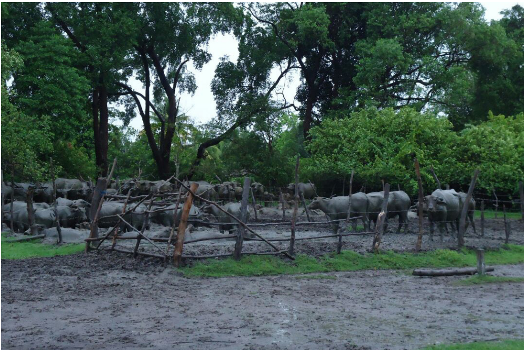
Figure 6. Cage buffalo in Indralaya district no roof cage.